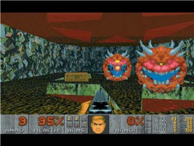
The Ultimate DOOM: Thy Flesh Consumed (id Software, 1995)